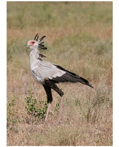
In the Serengeti

Scientific Name : Sagittarius serpentarius, Sagittarius=a bowman, archer. Serpentarius= interested in snakes. It is unlikely that the name is derived from the quill-like feathers that adorn their heads.